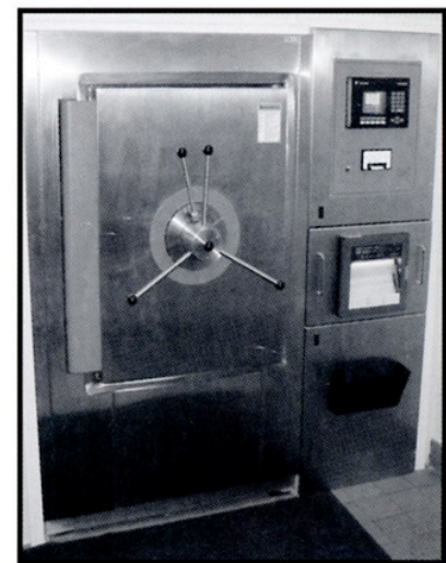
ARS Custom cGMP Sterilizer

ARS ENTERPRISES • 12900 LAKELAND RD. • SANTA FE SPRINGS, CA 90670